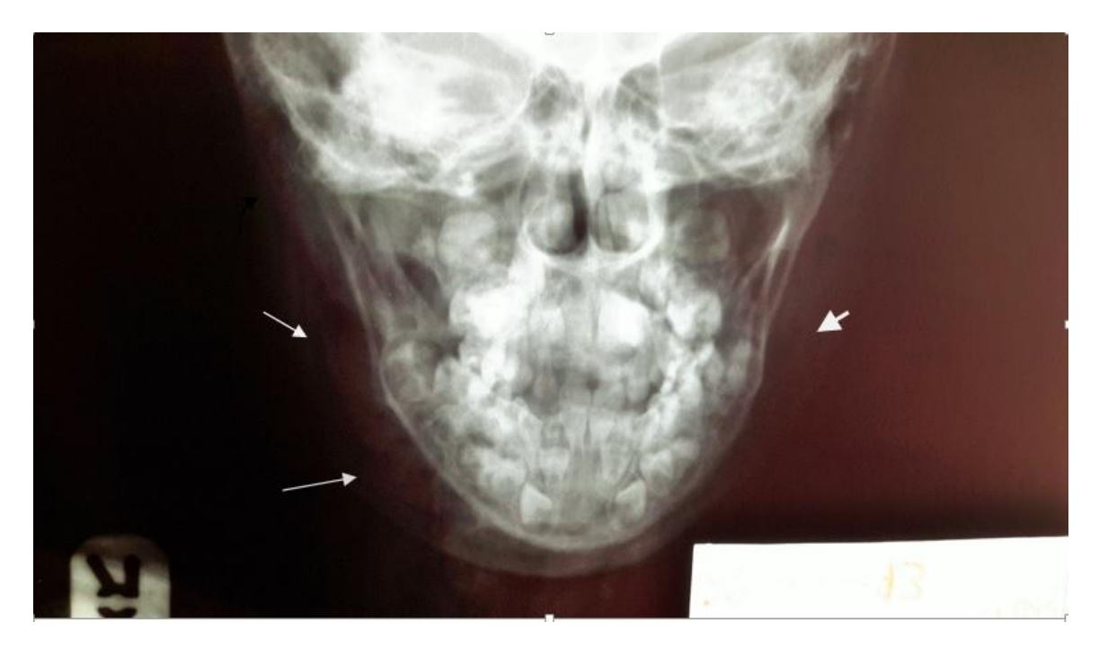
Medical Research Archives, Vol. 5, Issue 6, June 2017 Cervicofacial emphysema and pneumomediastinum complicating adenotonsillectomy

Figure 3. Jaws radiograph – Antero-posterior view shows increase in the soft tissue thickness on both sides of the jaw but more on the right. Ill defined pockets of lucencies are noted within the soft tissue: right (long arrows) and left (short arrow).