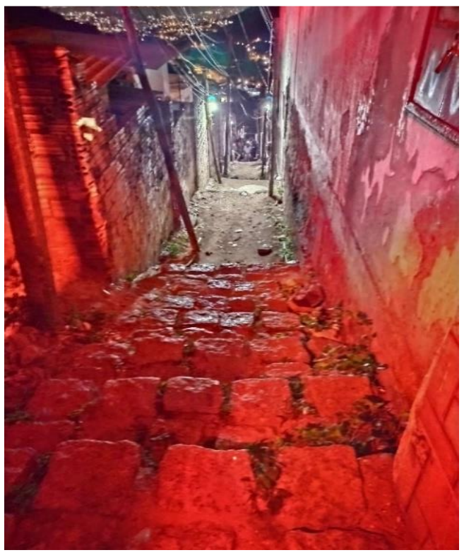
Figure 2: Access to some residences in Porto Alegre (night)