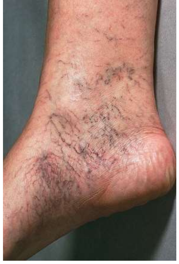
Figure 1: Corona phlebectatica paraplantaris with multiple telangiectasias and reticular veins in the area of the medial malleolus. These changes have been recently introduced to the CEAP Classification as stage C 4c.