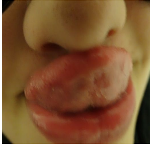
Fig. 8: Gorlin Sign

The input of the gutters is essential here because they also contribute to the proprioception by sending a special signal on the position of the head through contact with the tongue. The tongue shows remarkable stretching possibilities enabling it to touch (Figure 8) with its end the tip of the nose (sign of Gorlin), it can also be twisted exaggeratedly on its axis and often suffers bites together with the lips. Some foods cannot be chewed or are badly crushed, which accentuates the difficulties of swallowing and digestion. These difficulties are accentuated by the usual blunders when eating food in the mouth. These ingestion difficulties also apply to beverages with swabbing, accidental overturning, or the release of a glass or bowl.