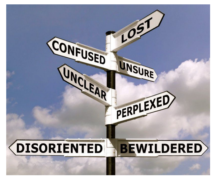
Figure 1: Physicians and Ehlers-Danlos diagnosis

Ehlers-Danlos is an inherited disease of the common connective tissue but is often. mistakenly, considered rare. It is still poorly and non-completely described, more often than not it is not diagnosed at all or it is diagnosed only after a long period of time and painful and dangerous medical wanderings for patients. A long list of diagnostic errors (Figure 1) causes iatrogenic effects as the disease is often wrongly diagnosed as fibromyalgia, multiple sclerosis, ankylosing spondylitis, Crohn's disease, asthma, endometriosis, Lyme disease, vascular facial algia, Gougerot-Sjögren disease, Raynaud disease, osteoarthritis and above all, psychiatric disorders (depression, hysteria, autism, bipolar syndrome, schizophrenia).