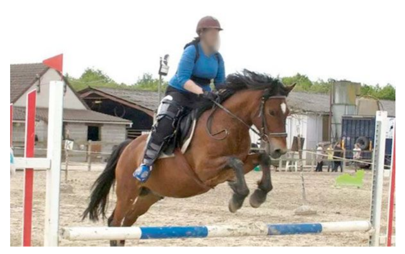
Figure 10 Ehlers-Danlos patient with lower limb orthesis and Belt. Sport is the best therapy