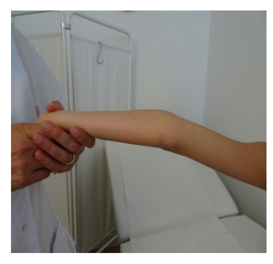
Figure 3: Elbow recurvatum