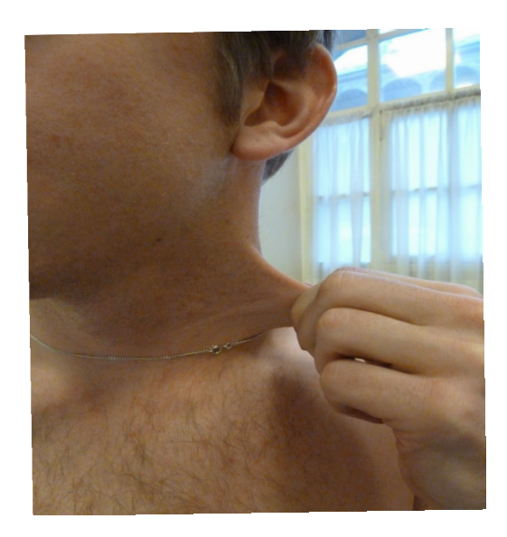
Figure 2: Etirable Skin