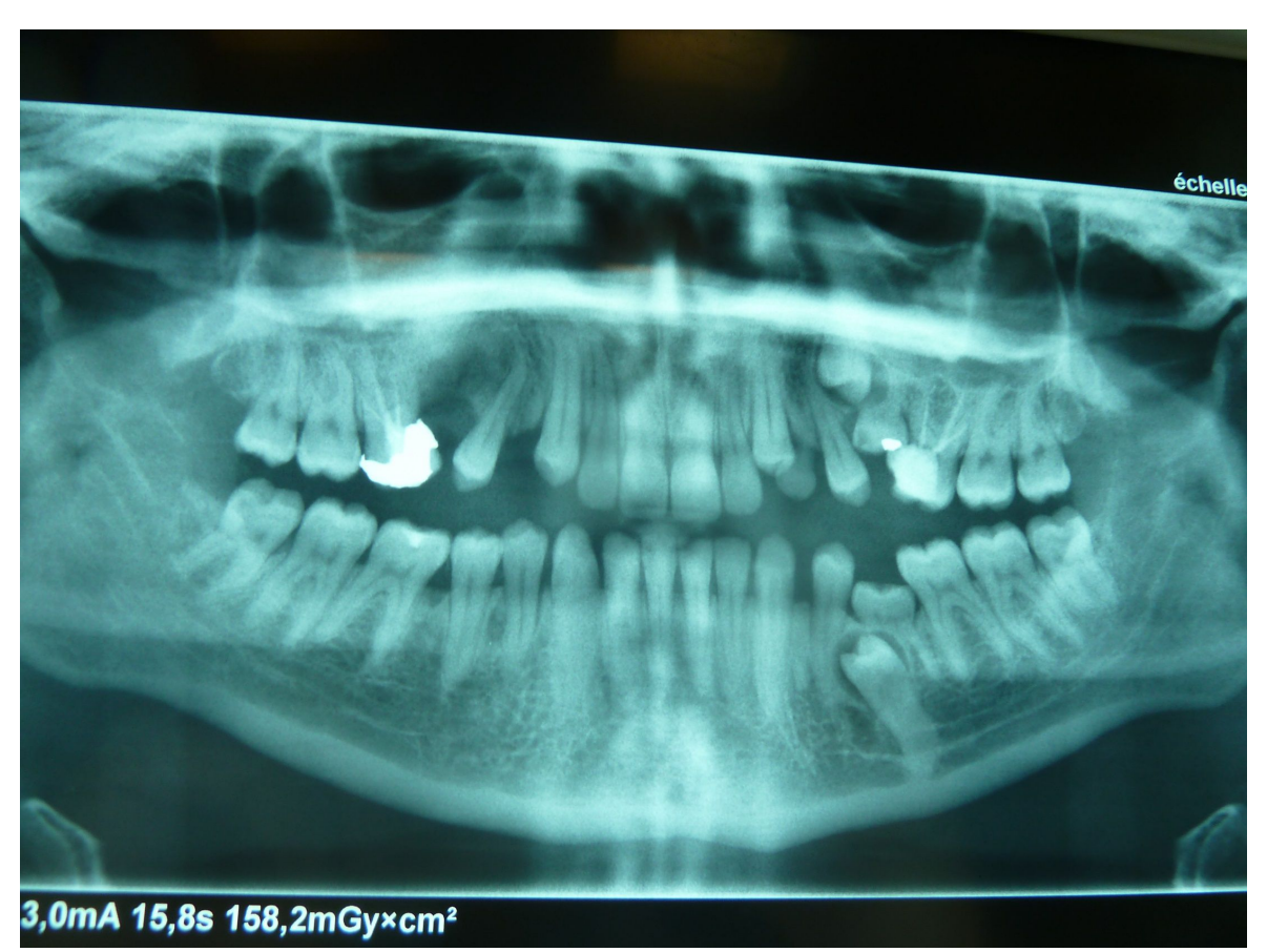
Figure 7: Teeth disorders

xylocaine gel and adapted toothbrushes. A shift in the dental joints is often favored by the appearance of the palatine vault. The lower position of the tongue prevents it from playing its role in the palatine growth, which causes oral respiration. Early pediatric diagnosis would enable speech therapy associated with dental orthotics. The teeth grow anarchically in time (figure 7), in the child, and in space with even possible horizontalization or inclusions. They are fragile with fractures, they are mobile because of the laxity of the dental ligament. Subluxations (cracks) and dislocations of temporo-mandibular joints are common during vawning, chewing or dental care. These joints are often painful and hinder chewing. Masticating muscles can also be painful, sometimes responsible for bruxism by dystonia. Dental anesthetics are often ineffective because of the rapid diffusion of products and require large doses associated with Adrenaline.