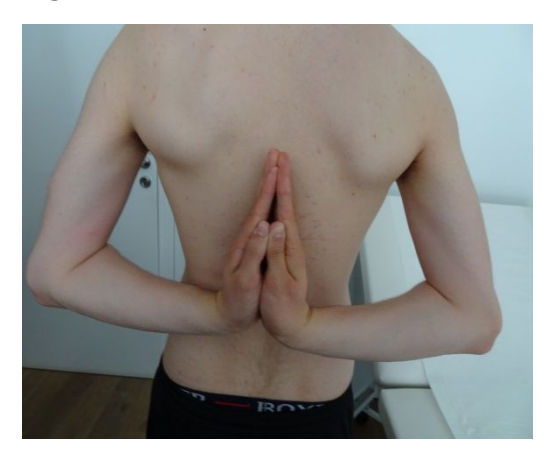
Figure 4: Schoulders hyperlaxity