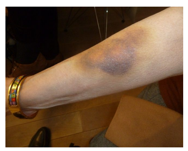
Figure 6: Ecchymosis

The nervous system, spared by genetic modifications, is programmed for a "normal" body, but it is confronted with a genetically modified body. The signals sent by their sensors are distorted either by exaggeration or, on the contrary, by reduction, and can even be totally lacking. For a better understanding of this complex symptomatology, it is also necessary to integrate biotope modifications that cause diet deficiencies as well as nutritional aspects.