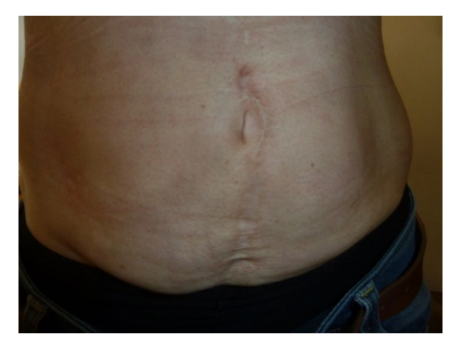
Figure 9: Scares after Ombilical Hernia Surgery

Constipation (11) is one of the most frequent manifestations of Ehlers-Danlos disease. The major complication is occlusion ( figure 9 ) with its corollary intestinal resection with often important consequences. It is accessible to the usual treatments of constipation with variable effects, sometimes requiring laxatives and intestinal enema.