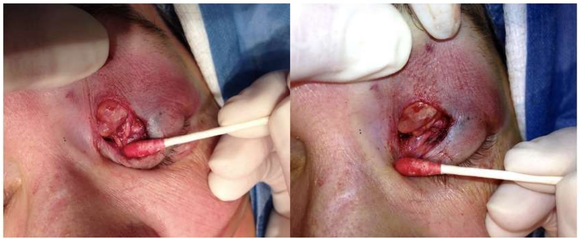
Figure 2. Cystic lesion of the medial orbital lobe of the lacrimal gland with a grossly normal appearing lateral orbital and palpebral lobe.