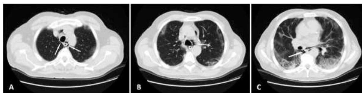
Figure 2: Axial CT images (A, B and C) showing the presence of air (arrows) in the mediastinal region.

18 days after admission, the patient complained of chest pain, which increased with respiratory acts. An electrocardiogram was performed and cardiac enzymes were measured. Both were normal and did not support myocardial infarction. We performed another CT scan, which showed extensive pneumomediastinum ( fig.2 ).