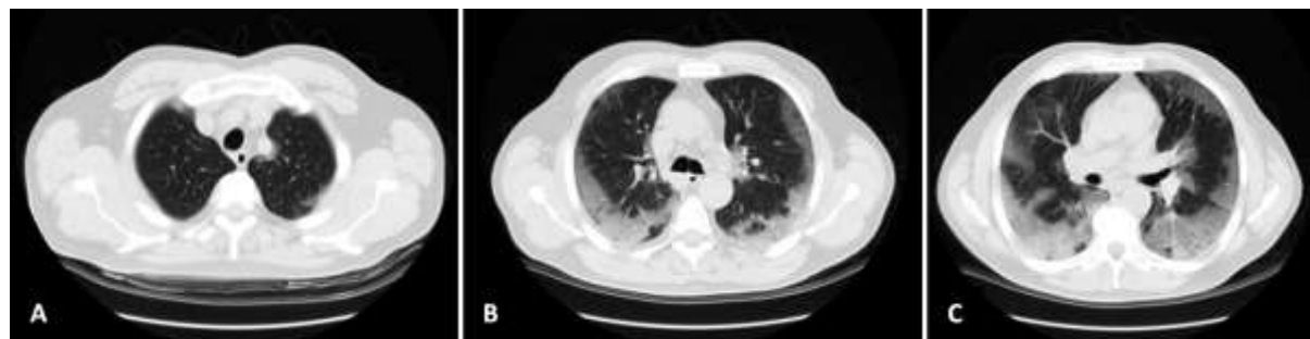
Figure 1: Axial CT chest images showing bilateral ground-glass opacities, predominantly in peripheral (A, B) and lower regions of the lungs (C).

which revealed bilateral ground-glass opacities in up to 50% of the lung parenchyma.