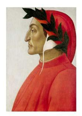
Apri la mente a quel ch'io ti paleso e fermalvi entro; ché non fa scienza, sanza lo ritenere avere inteso.

There has always been a question as to whether the works of Leonardo da Vinci are illustrations with text describing them, or text with illustrative figures. Of course, it is the combination of text and images which optimizes our powers of perception and conceptualization so we can understand the message being communicated, and indeed, this concept has been clearly defined by the divine poet Dante Alighieri (Figure 1).