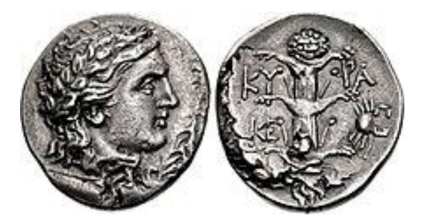
Figure 3. A coin of Magas of Cyrene c. 300–282/75 BC. Reverse: silphium and small crab symbols.

In ancient Rome and Greece, women used an oral contraceptive called silphium - the lost ancient world's herbal birth control. Due to its value, the herb was depictured in a coin together with a crab which at that time was a cancer disease name (Fig. 3). Possibly silphium was used for cancer prevention/treatment too.