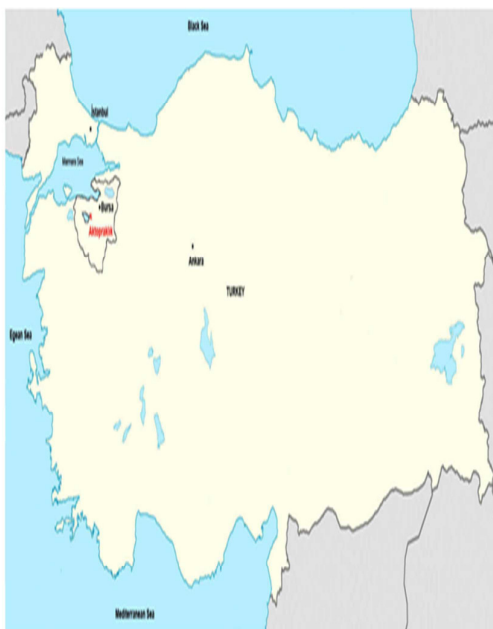
Figure 1 Excavation area on map.

The photograph represents a section of the burial excavation. Four skeletons have been found by Karumet al.in the burial: an adult woman, man and two child skeletons. Two adults have been positioned back to back hands tied at back suggesting a possible sacrifice cult. Each child's skeleton has been positioned between the adults' legs, buried separately. Because the four skeletons were unearthed at different depth levels and for other reasons, a photograph of all four skeletons together could not be obtained.