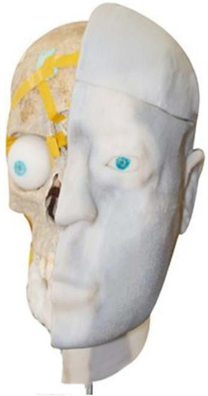
Figure 5. Half of the re contracted face printed as 3D.