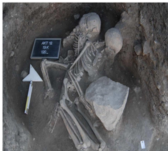
Figure 2 The skeletons in burial.