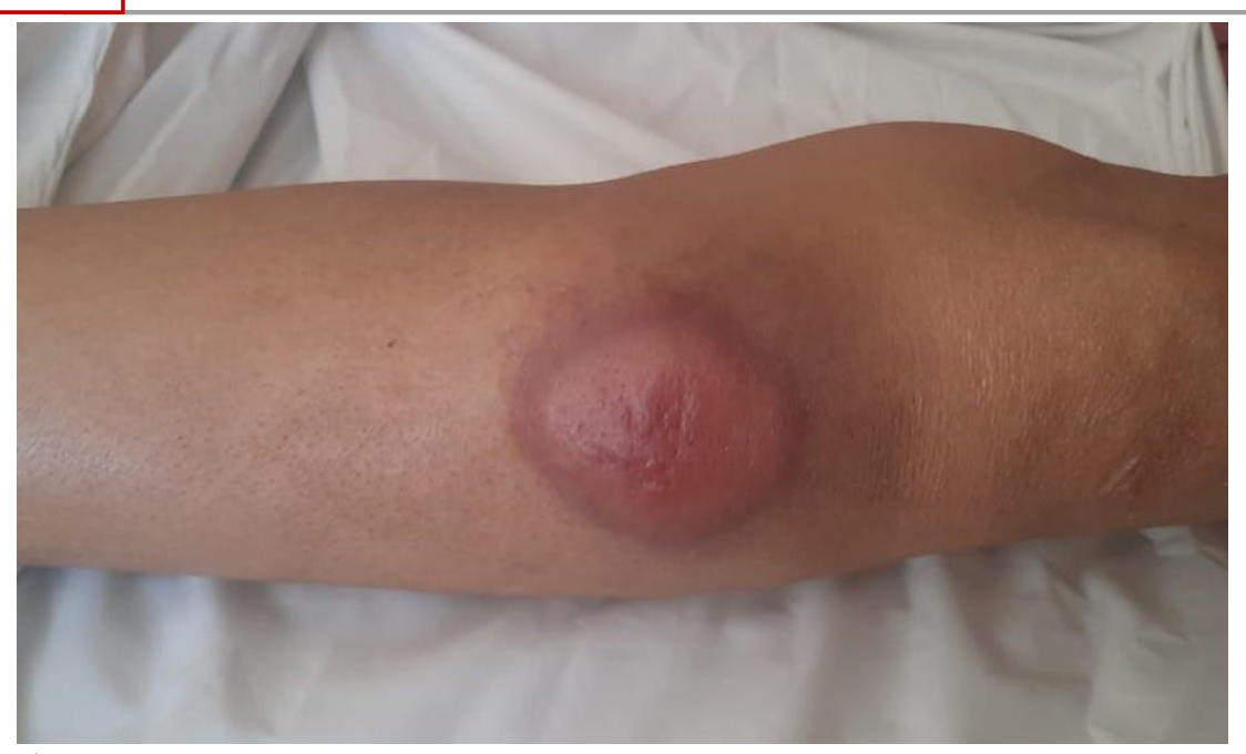
Figure 1: The mass under the knee