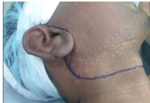
Figure 1: Modified Blair incision on right cheek

From the data collected between October 2016 to December 2022 by analysing the management pattern for patients with venous malformation, 15 patients were selected. All these patients underwent corset suturing procedure and were diagnosed with symptomatic venous malformations. A retrospective analysis and radiographic review were performed at the Bhagwan Mahaveer Jain Hospital. Patients with Low-flow vascular malformation who had difficulty in speech, swallowing and Lesions that were causing primary facial deformity were included. Exclusion criteria were High-flow arterial malformations, lesions having a self-healing tendency, lesions involving critical structures such as the eyes and carotid artery, and those in inaccessible spaces of the head and neck [16]. For the patients where assessing the lesions was difficult, follow up MR images were obtained.