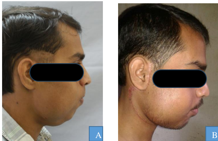
Figure 4: Case 1: Pre operative and postoperative images of patient with type II low flow venous malformation on right side of the cheek