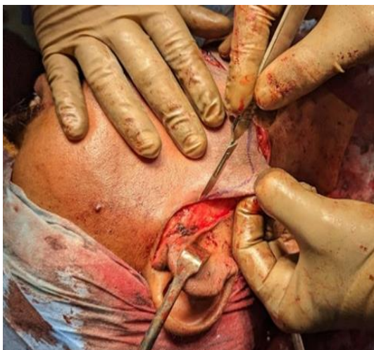
Figure 3: Excess skin marked on the skin flap

It is important to perform the corset suturing in this fashion because of the presence of the sinuous, winding, and random network of vascular channels and collateral circulation present within the tumour [16]. The sutures need to be secured tightly with caution to reduce the amount of venous channels and compress the lumina which in turn decompresses the lesion and reduced the risk of haemorrhage. The flaps are reappromixated by marking and excising the excess skin (figure 3). Drains are placed and good closure is obtained.