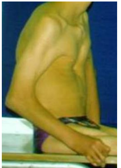
Figure 5. The clinical phenotype of a -15-year-oldboy-showed the apparent webbing of the axilla, pectus excavatum, camptodactyly and the multiple inter-digital –webbing

Two unrelated children from different backgrounds (one girl and one boy, aged 2-4 year) and a -15year-old boy were referred to our departments with diagnosis of arthrogryposis multiplex congenita. Clinical examination showed distinctive facial features of a relatively mask-immobile face with downturned corners to the mouth, epicanthic folds and ptosis. Webs seen clearly at the neck, axillae, antecubital, groin, popliteal region and in fingers. the camptodactyly between The phenotype of a -15-year-old-boy-showed the apparent webbing of the axilla, pectus excavatum, camptodactyly and the multiple interdigital -webbing (Figure 5). Lateral spine radiograph in a-4-year-old-boy with Escobar syndrome showed progressive thoraco-lumbar kyphoscoliosis (figure 6,a). 3D Reconstruction Spine CT scan of a-4-year-old-boy with Escobar syndrome showed severe congenital scoliosis due to non-segmented bar Th11-L5 on the left side (figure 6,b).