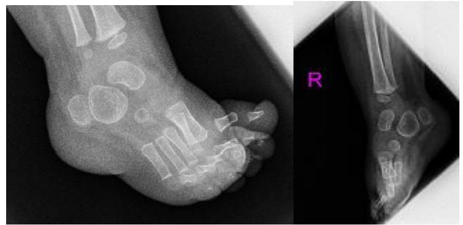
Figure 3 (a,b): Lateral foot radiograph of an 18-months.old-girl with Larsen syndrome showed two ossification centres of the calcaneus associated metatarsophalangeal subluxations.