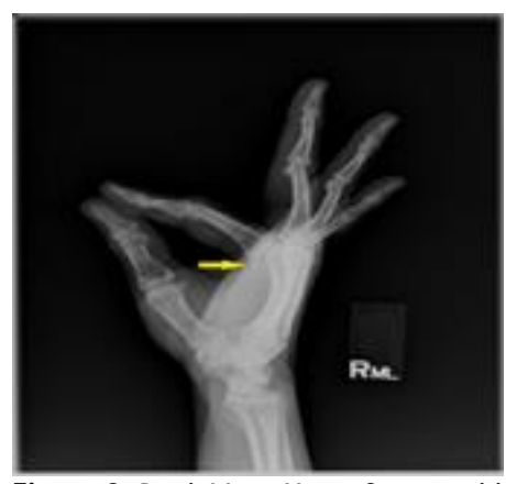
Figure 2. Pinch View Xray: Sesamoid bone volar to 2nd MCP Head (arrow).

The differential diagnosis considered for the patient's condition included trigger finger, sesamoiditis, capsulitis, second metacarpal posterior glide, as well as the possibility of a flexed right capitate and an abducted right ulna. Each of these potential diagnoses was evaluated based on the patient's symptoms, physical examination findings, and imaging results to accurately pinpoint the underlying cause of the finger discomfort and locking sensation.