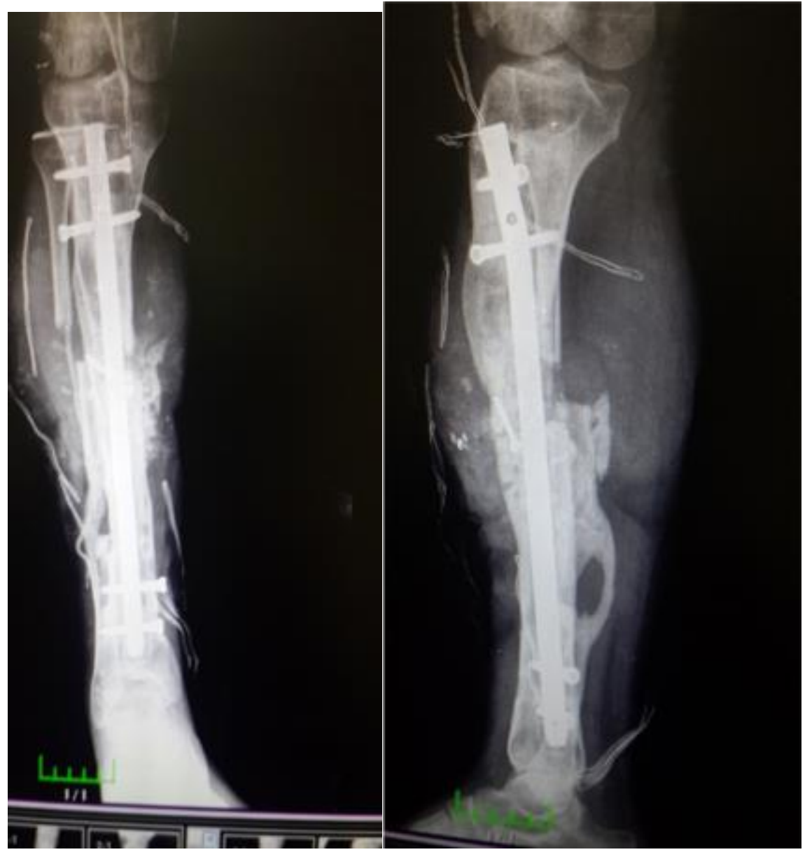
Figure 1c-d: Treatment of non-union with Intra-medullary nail.