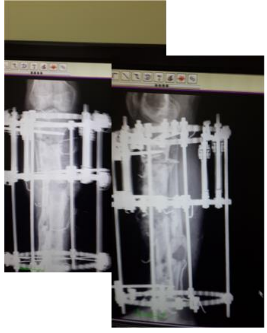
With Ilizarov system, simultaneous proximally bone transport and treatment of nonunion.