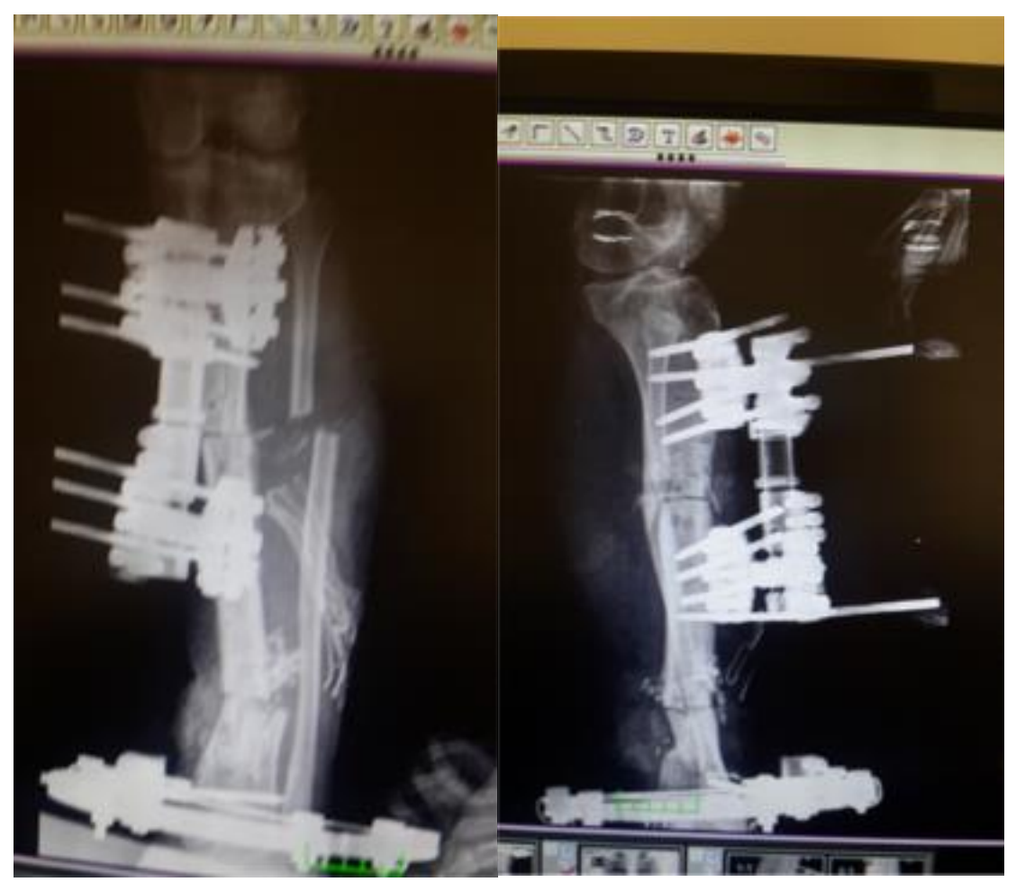
Medical Research Archives, Vol. 5, Issue 2, February 2017 Outcomes of high energy tibial fractures with different fixation systems