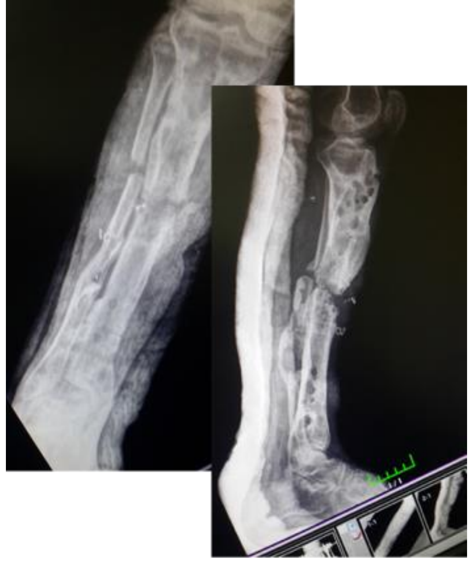
Figure 1e-g: Union wasn't obtained with Intra-medullary nail at a reasonable time.