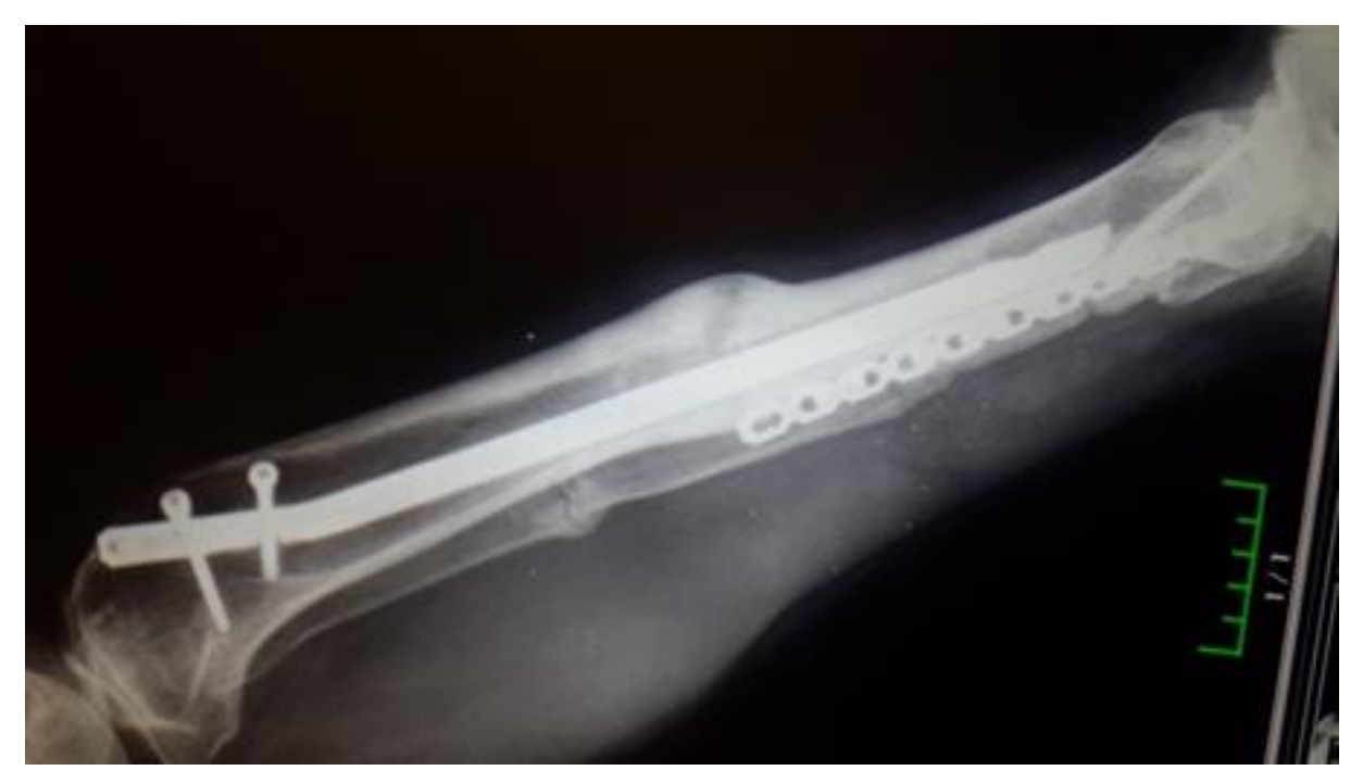
Figure 4 c