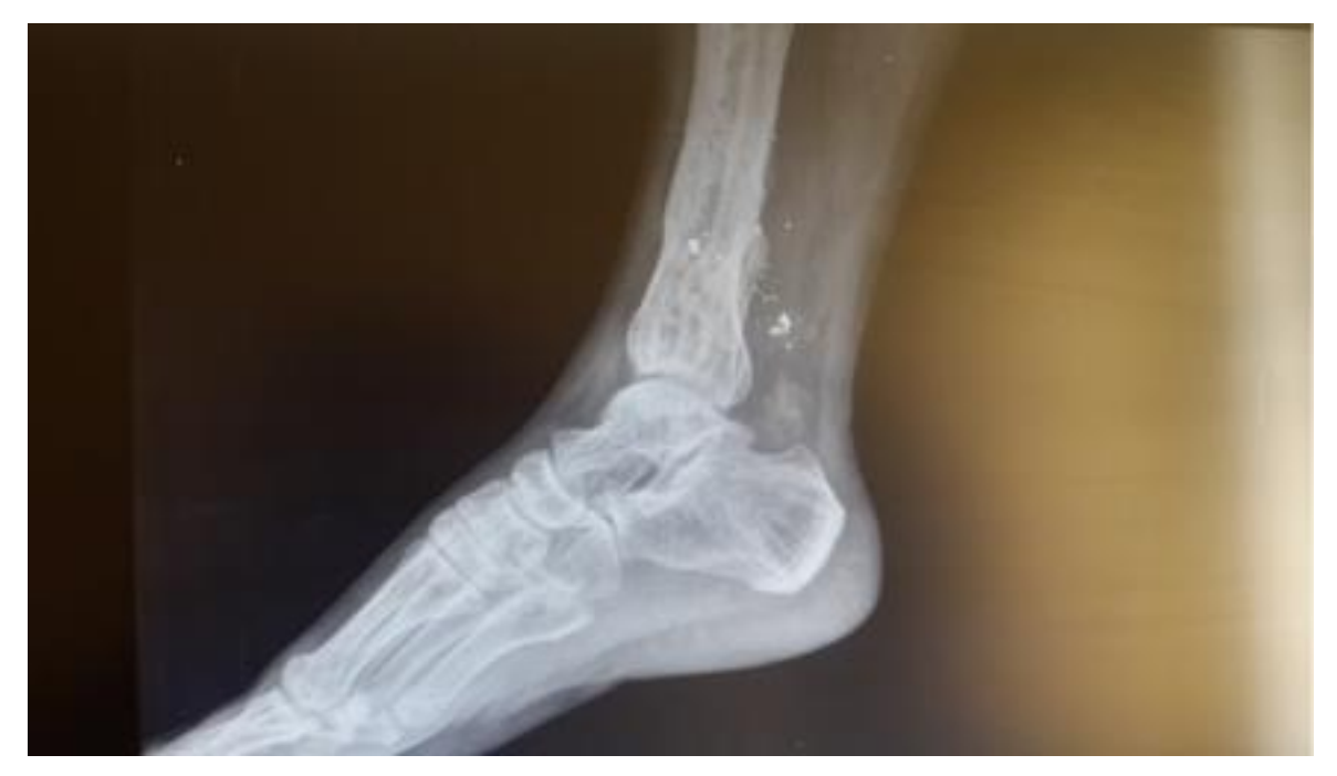
Figure 3 f