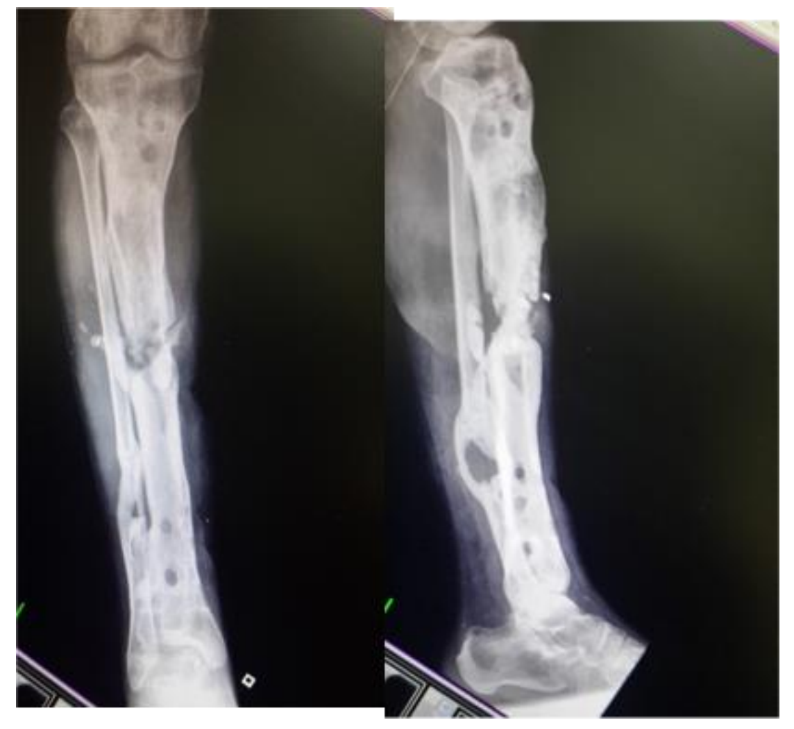
Figure 1a-b: After removal of external fixator, non-union.