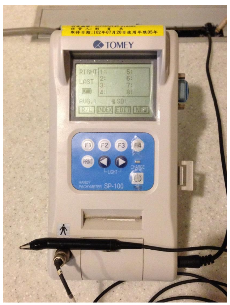
Figure 1. Ultrasound pachymeter

Ultrasound pachymetry is the most common method to evaluate CCT (Figure 1).