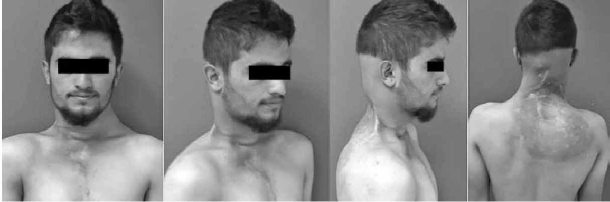
Figure 2: Photographs of the same patient after two months later (after surgery combined with radiotherapy) (from Toplu Y, Öztanır N, Çetinkaya Z, Koç A, Kızılay A. [Giant desmoid tumor in the neck]. Kulak Burun Bogaz Ihtis Derg. 2014 Sep-Oct;24(5):299-302.)

The prominent affected location is mandible, followed by the submandibular region, tongue, neck and paranasal sinuses. Kruse et al. (Kruse et al. 2010) proved that approximately 57 % of all desmoid tumors of head and neck region existed in pediatrics under age 11 and they may present at a younger age comparison with other regions, with a median age of 3.6 years versus 7.8 (Zheng et al. 2016).